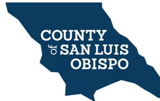
County of San Luis Obispo