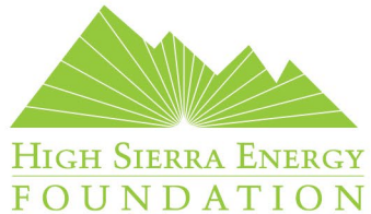
High Sierra Energy Foundation