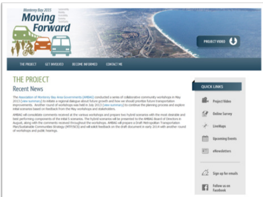
Screenshot of the Homepage

The AMBAG LiveMaps tool is organized by Land Use and Planning (city limits, airports, land use, etc.), Natural Features (fault lines, fire hazards, waterbodies, etc.), and Transportation (bus routes, bikeways, trails, etc.). These categories will be expanded and new data added as it is made available and organized.